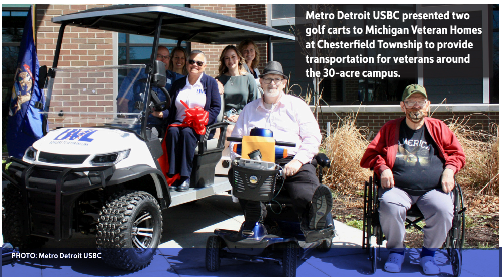
Metro Detroit USBC presented two golf carts to Michigan Veteran Homes at Chesterfield Township to provide transportation for veterans around the 30-acre campus.